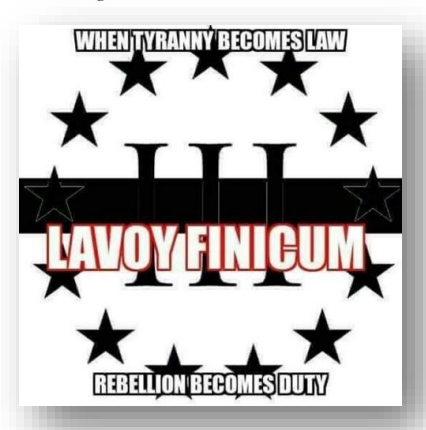
(U) III% Badge being displayed via social media, honoring Finicum