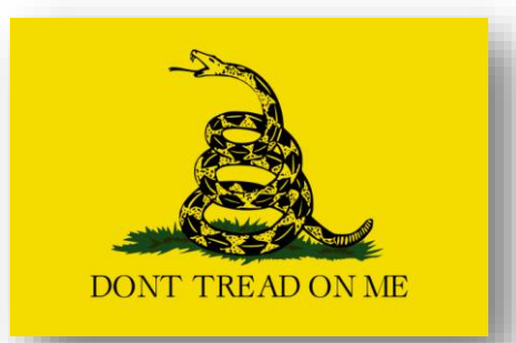
(U) Gadsden flag, commonly displayed by sovereign citizen extremists

(U//FOUO) Below are some visual indicators of these potential extremist and disaffected individuals: though some or parts of these symbols are representative of patriotic and American revolutionary themes; they are often associated with extremism: