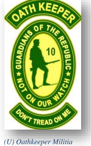
(U) Oathkeeper Militia symbol, commonly associated with extremists